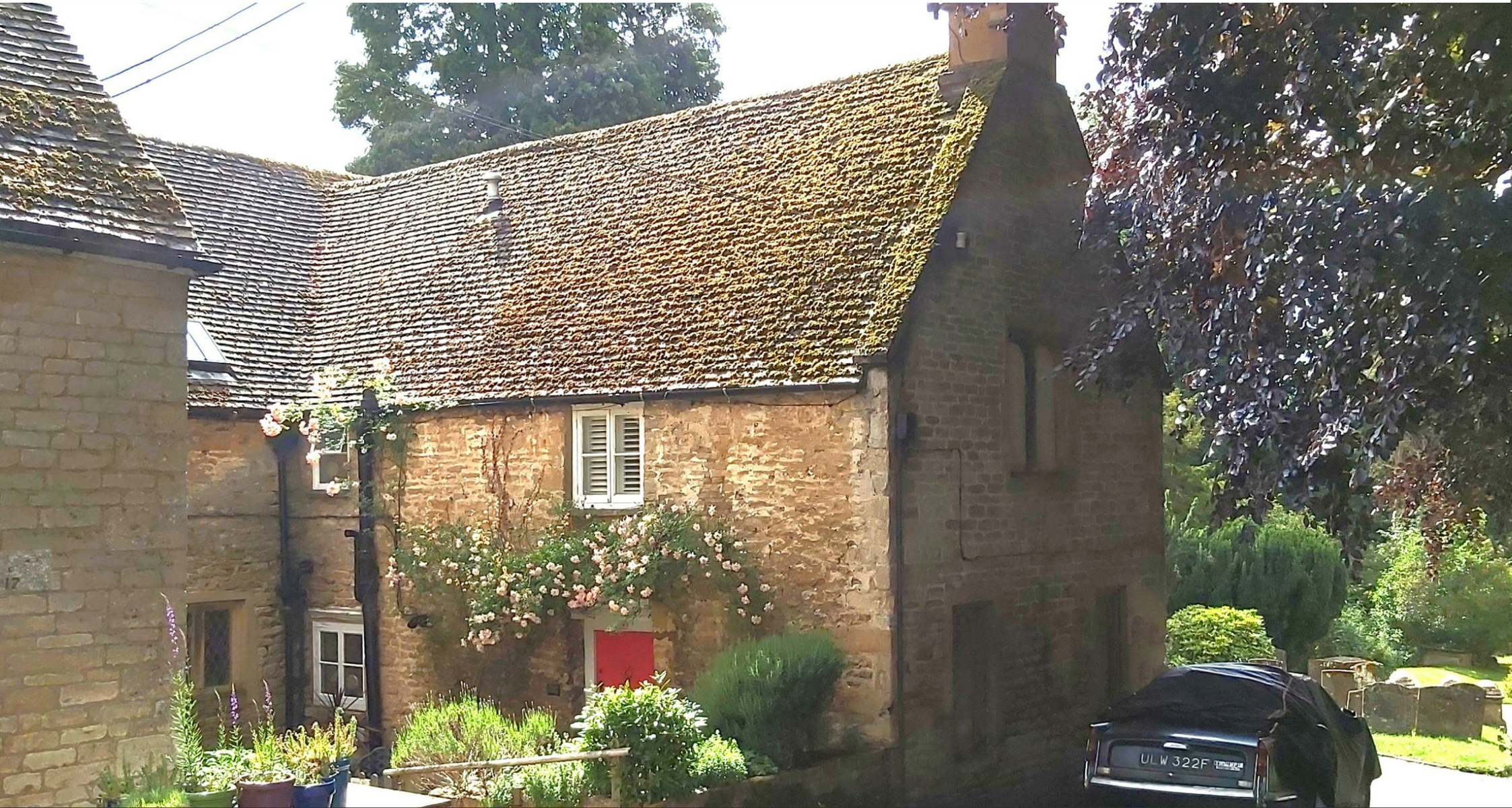
Church Cottage 6 Church Street Chipping Norton, OX7 5NT Guide Price £279,500